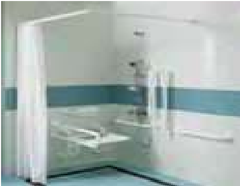
Doc.M Shower Pack