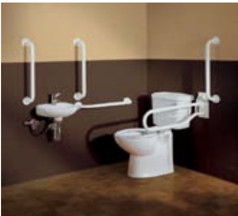
Doc.M value pack