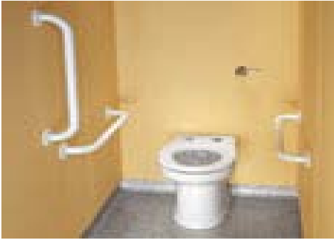
Doc.M rimless ambulant btw pack