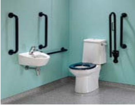
Doc.M rimless super pack